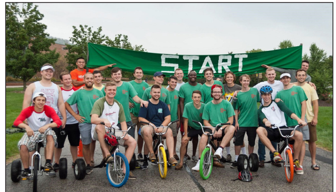
Despite the rainy weather, this year's Phi Psi 500 had an excellent turnout with five sororities and five fraternities participating in the event.