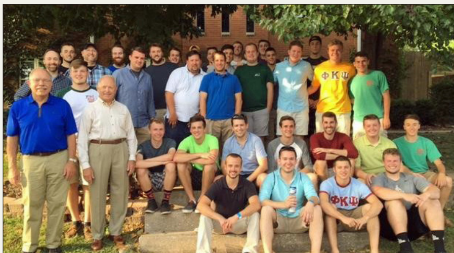
It is always a good time when generations of Indiana Epsilon brothers come together and enjoy each other's company.

Homecoming weekend is a perfect opportunity to reunite with old brothers and meet the new actives.