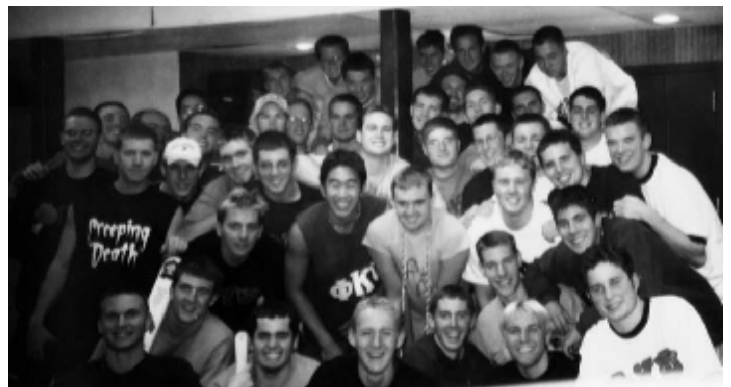
All of the brothers with the new Fall 2000 pledge class spring class sporting their new letters.