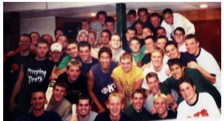
All of the brothers with the new Fall 2000 pledge class spring class sporting their new letters.

This is a great accomplishment for our fraternity. Most likely, we are set for next year since we are not losing too many of our star