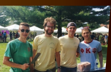
Indiana Epsilon brothers cooking out at a recruitment event