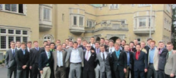
Indiana Epsilon celebrates its new member class