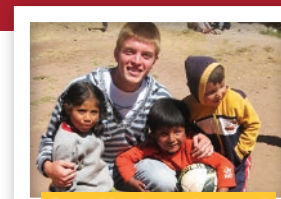
Several brothers volunteered in Haiti, Mexico and Nicaragua last year